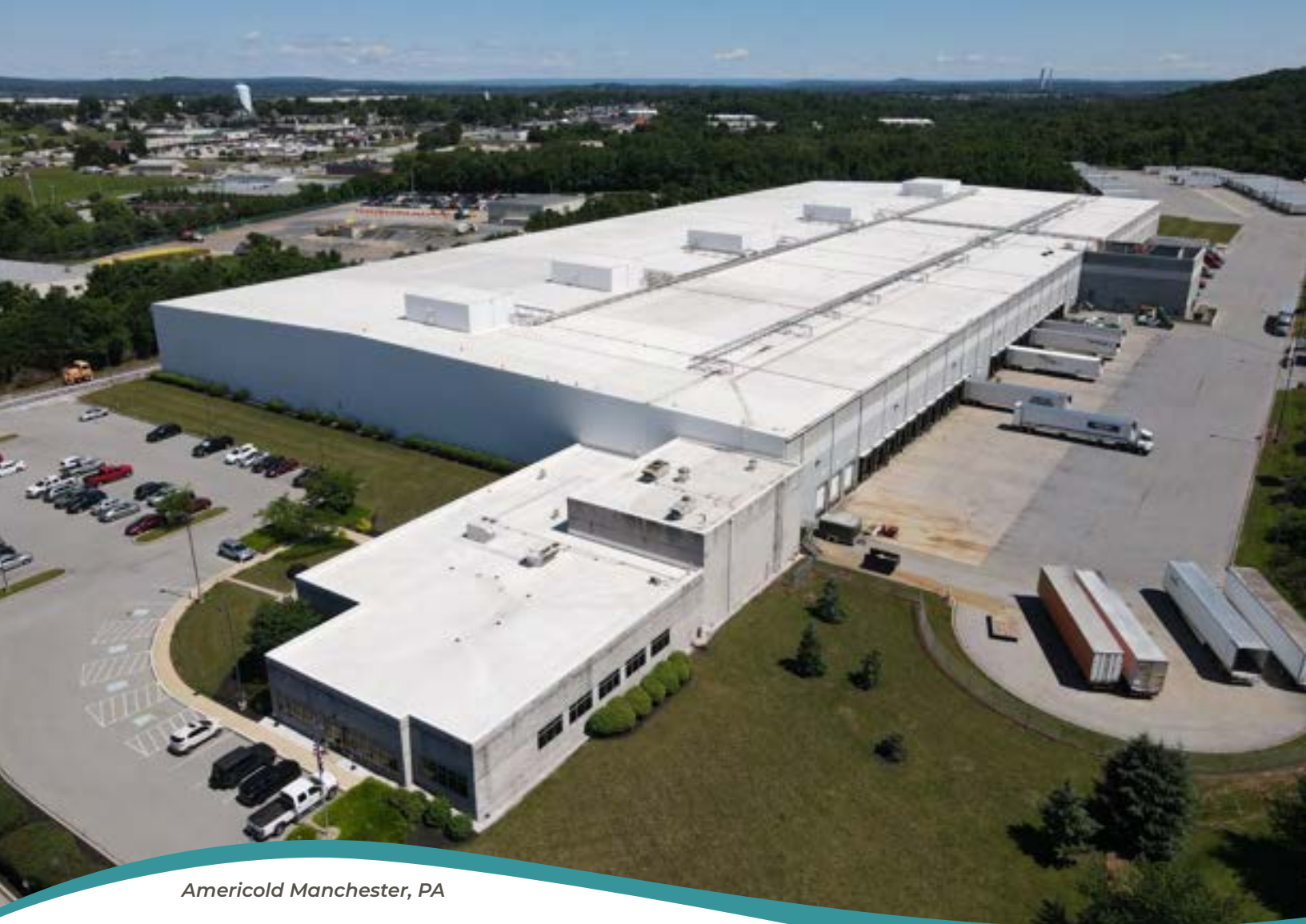
Americold Manchester, PA