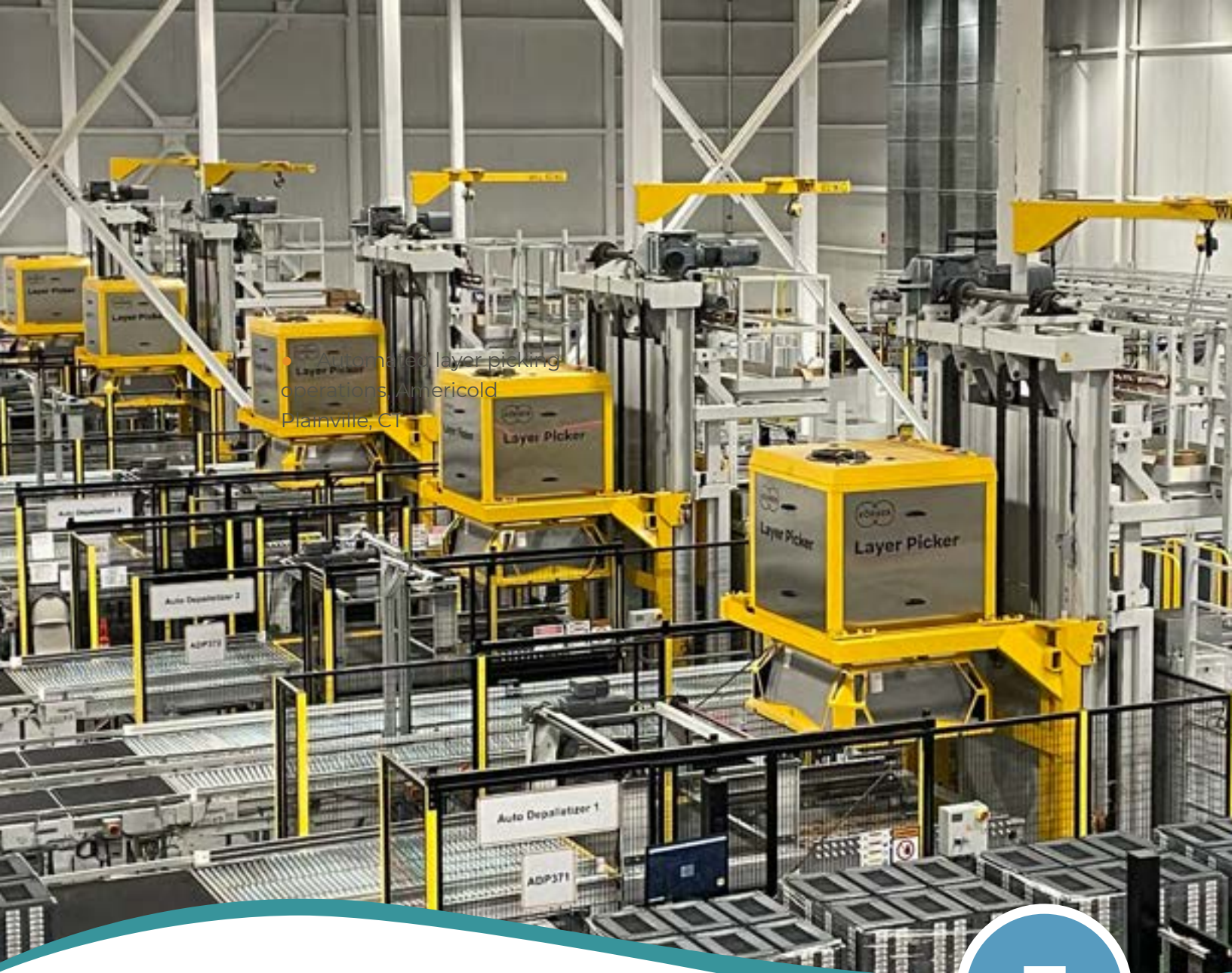
Automated layer picking operations, Americold Plainville, CT